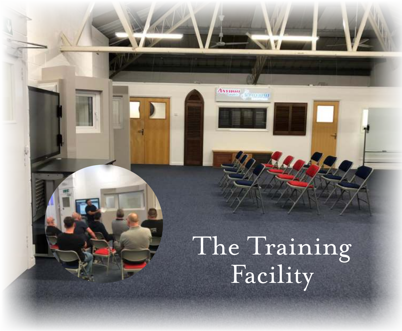
The Training Facility